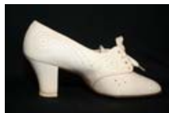
Shoes from the 1930s